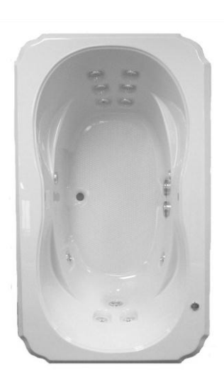
72"x42"x22" Shipping weight - 180lbs

Operating Gallons - 55 gal. reg. usage 75 gal. upper body usage Upper body jets can be shut down for operation at a lower level